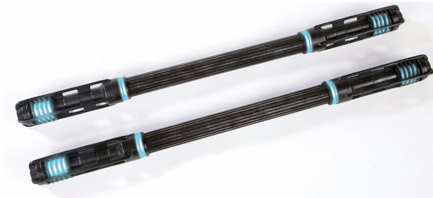
(Floyd's electrical sticks)