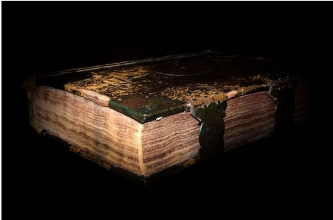
(Victor's Cipher Book)