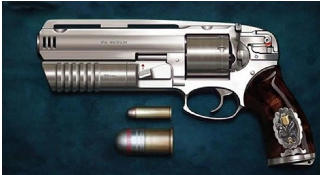
(Viktoria's new revolver)