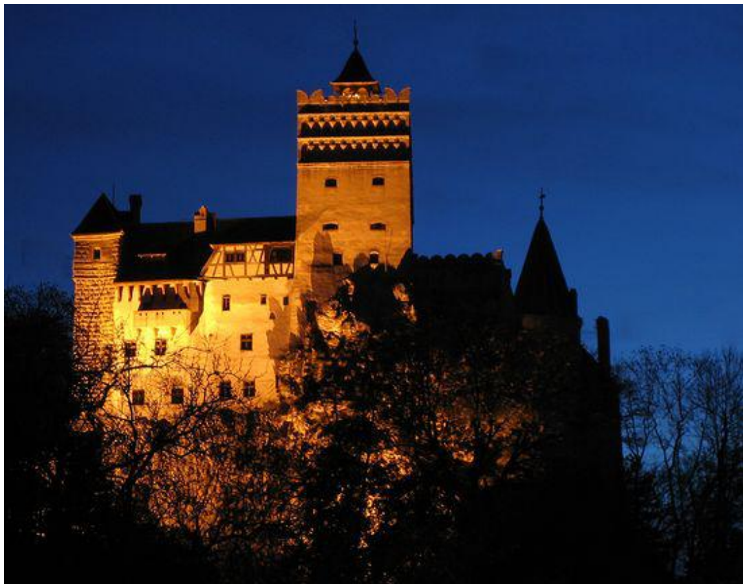
(Bran 'Dracula's' Castle)