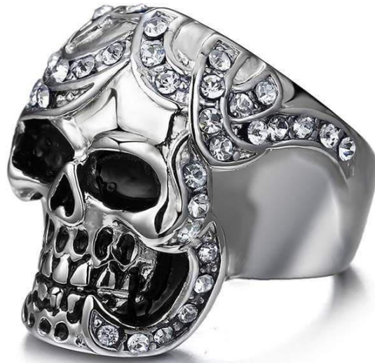
(Rose's skull ring)