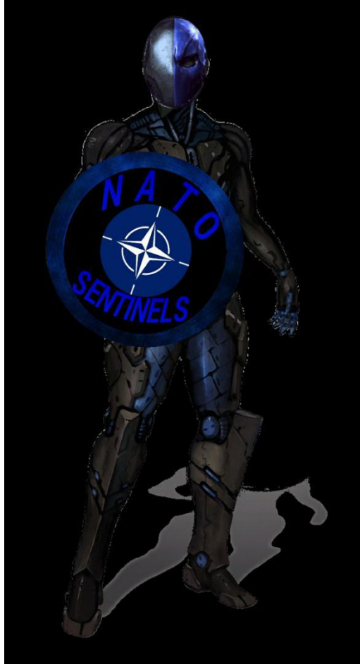
(Frank's new suit and shield)