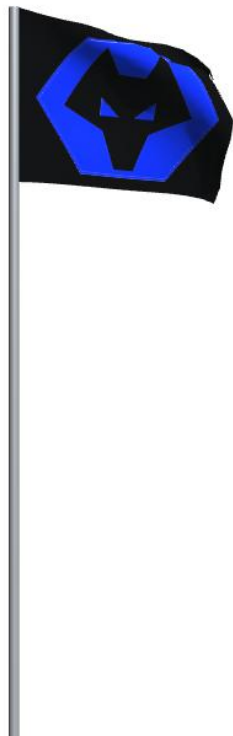
(The Sentinels flag)