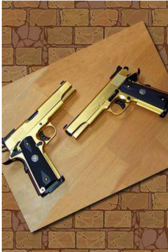
(Victor's golden guns)