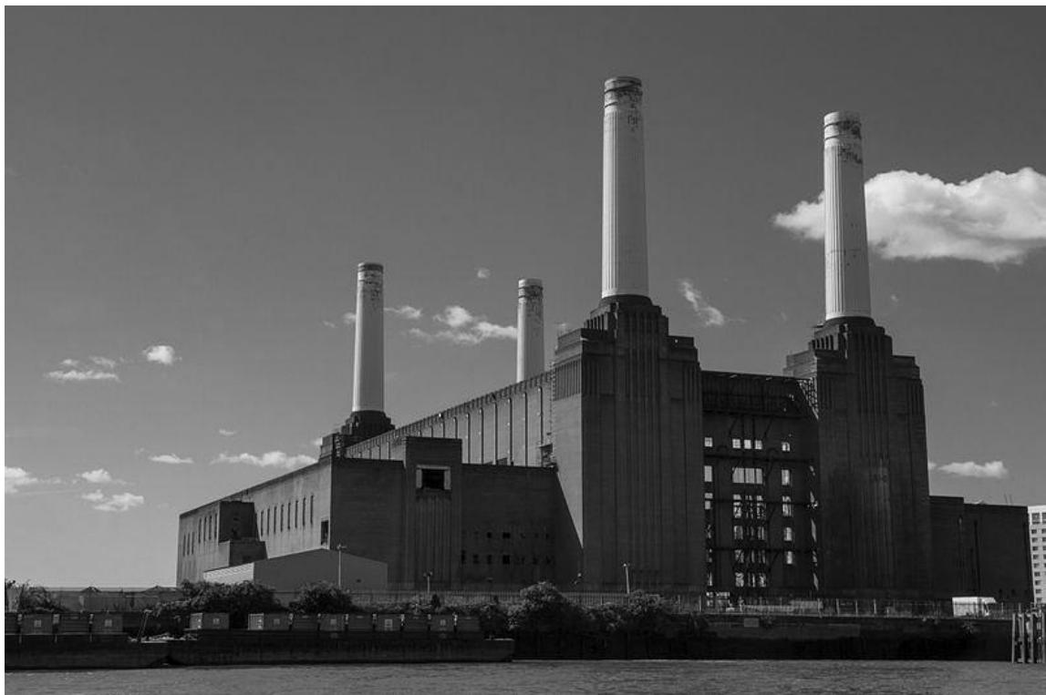
(Battersea Power Station)