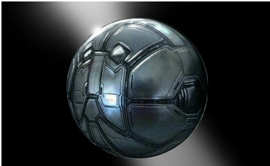
(The Electronic Ball)