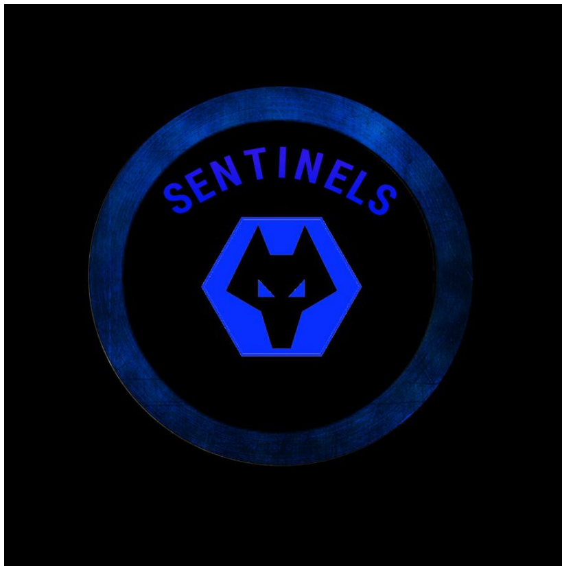
(Frank's new shield)