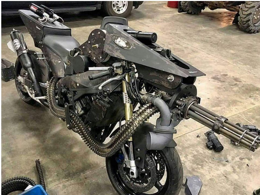
(Floyd's new motorcycle)