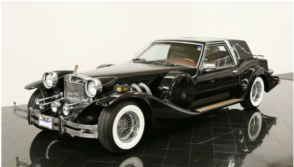
(Victor's Zimmer Golden Spirit)