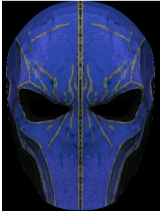
(Victor's new mask)