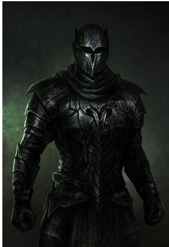
(Dracula's Castle Knight Guard)