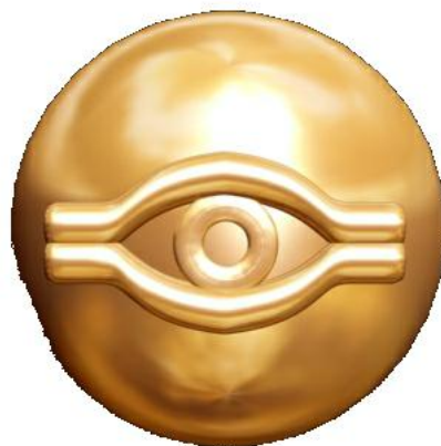
(The Eye of Sight)