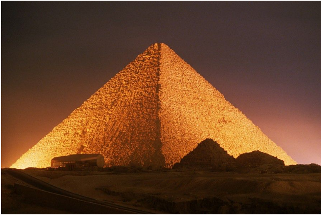
(The Great Pyramid)