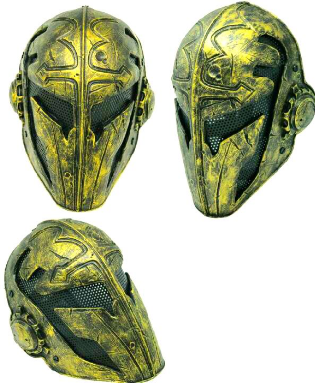
(The Golden mask of the pharaohnic war leader)