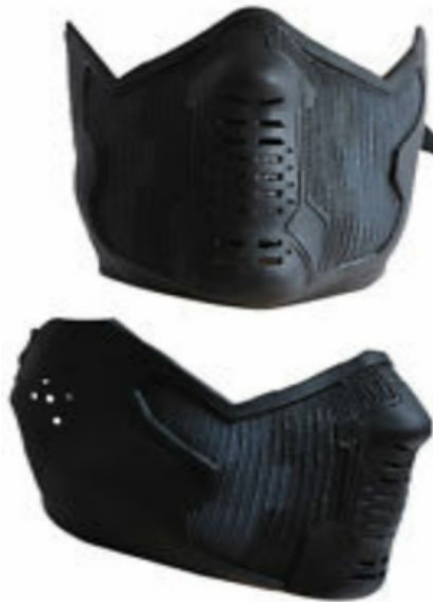
(The 'Savage' Adrian's mask)