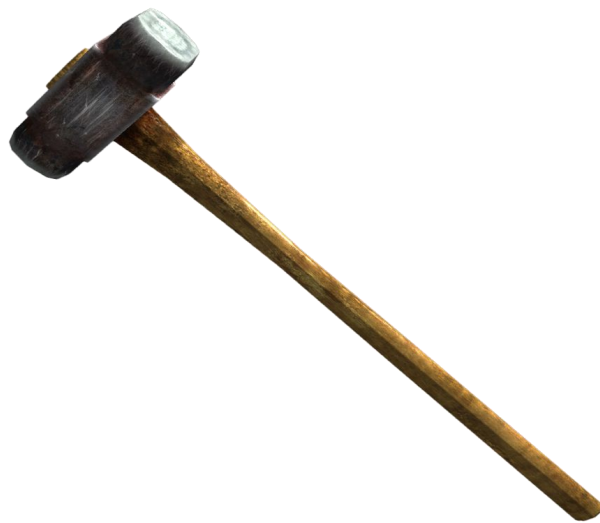
(The Judge's sledge hammer)