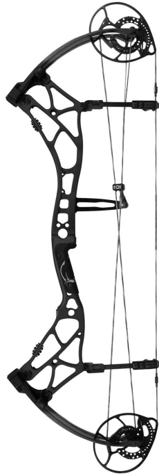
(Arrow's Mechanical Bow)