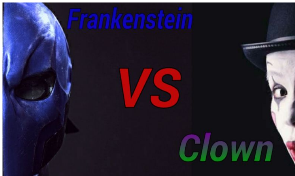
(Frankenstein vs The Clown)