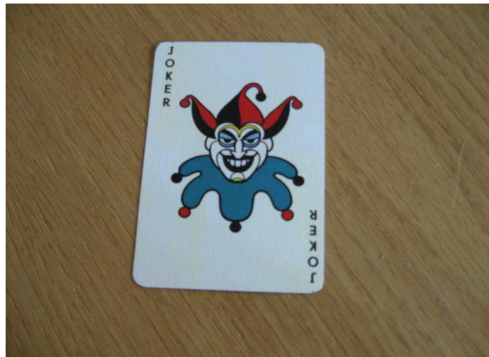
(The Joker card used by the new "Joker")