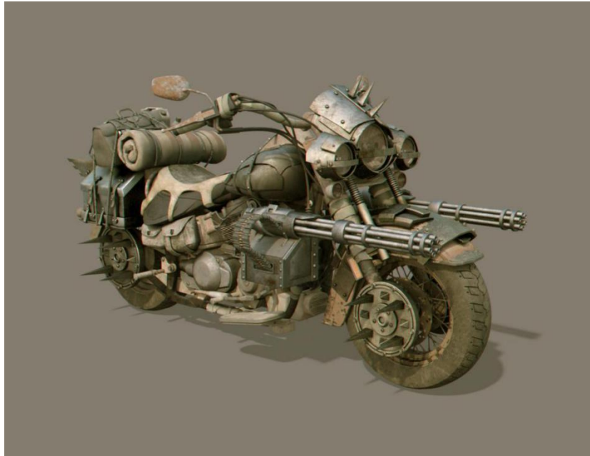
(Isaac's motorbike during the D-Day)