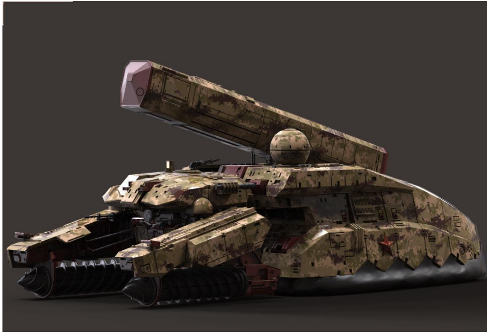
(The Shagohod Tank)