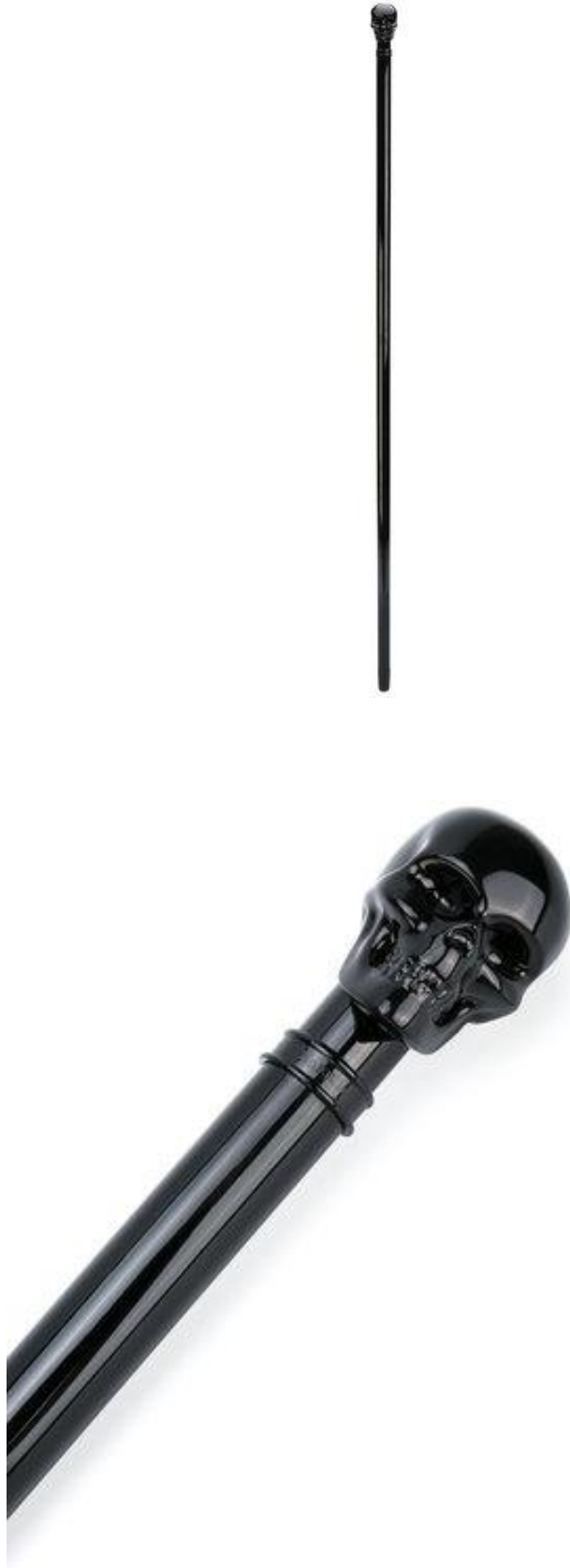
(Victor's skull cane)