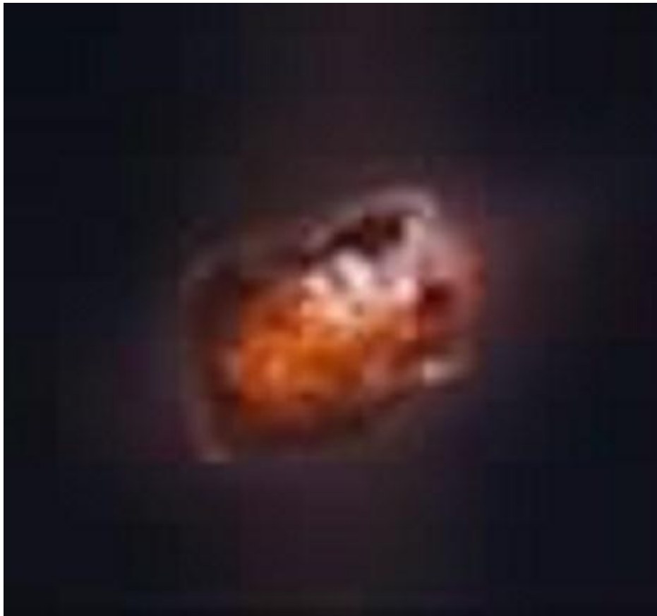
(The Soul Stone)