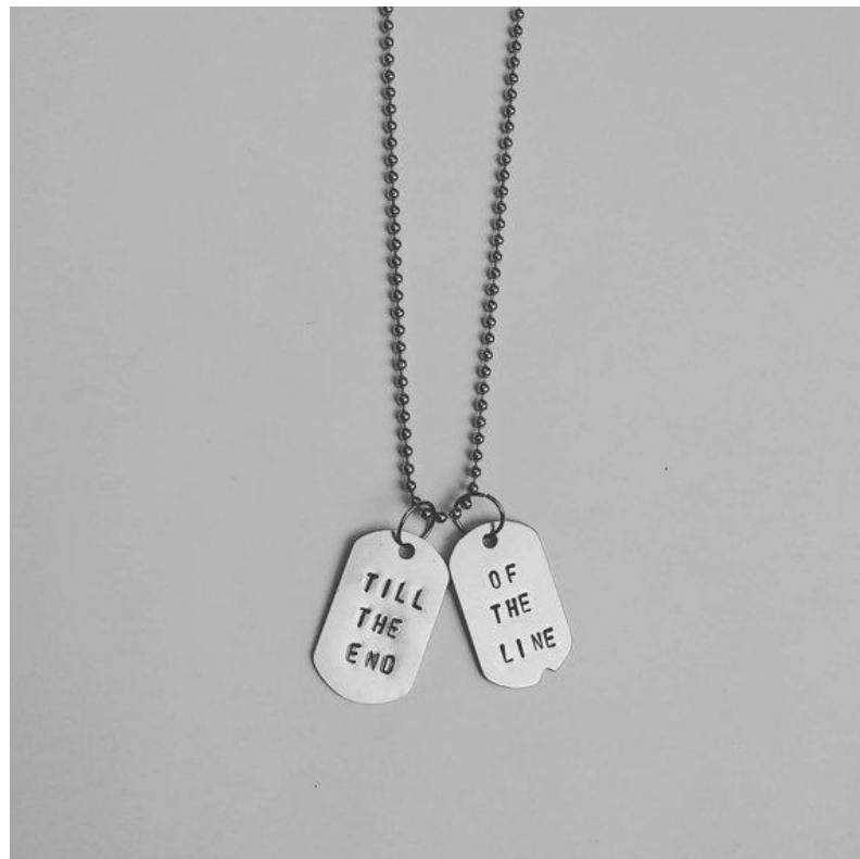
(Tags of Friendship)