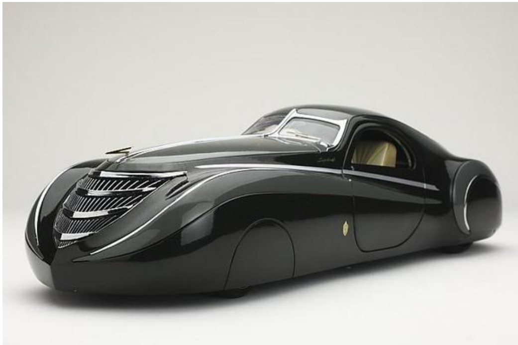
(Karl's special car)