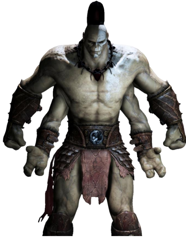
(Horus's locked up creature in the Black sea's lost island)