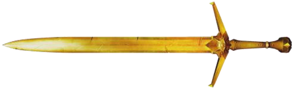
(Victor's golden sword)