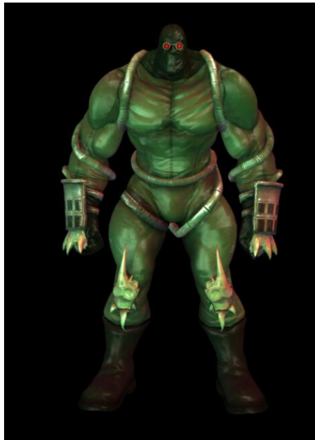
(The German Beast)