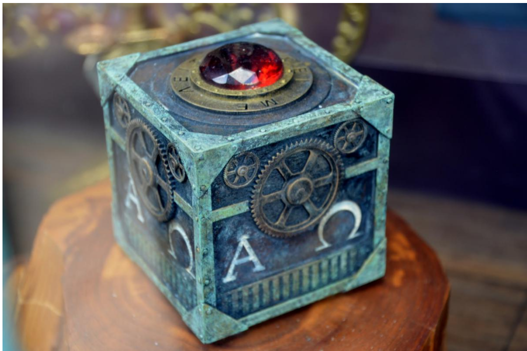
(The Trap Cube)