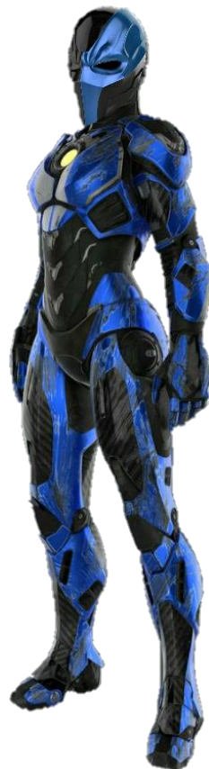
(Female design of the Frankenstein suit used by Hylaria & Jenny)