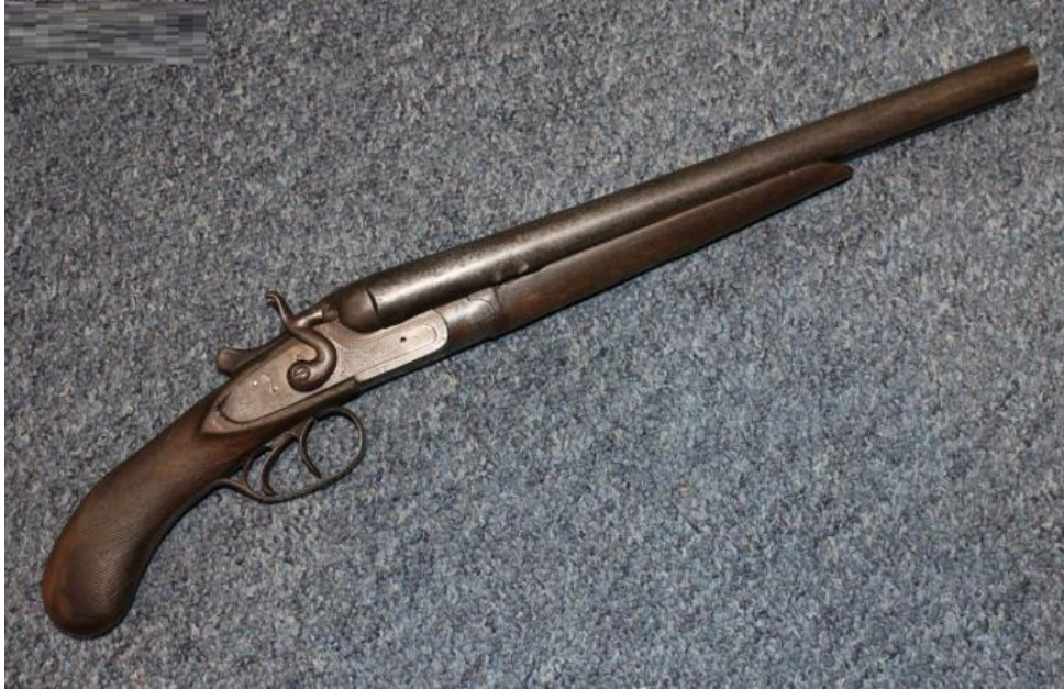
(Moshe's Sawn off shotgun)