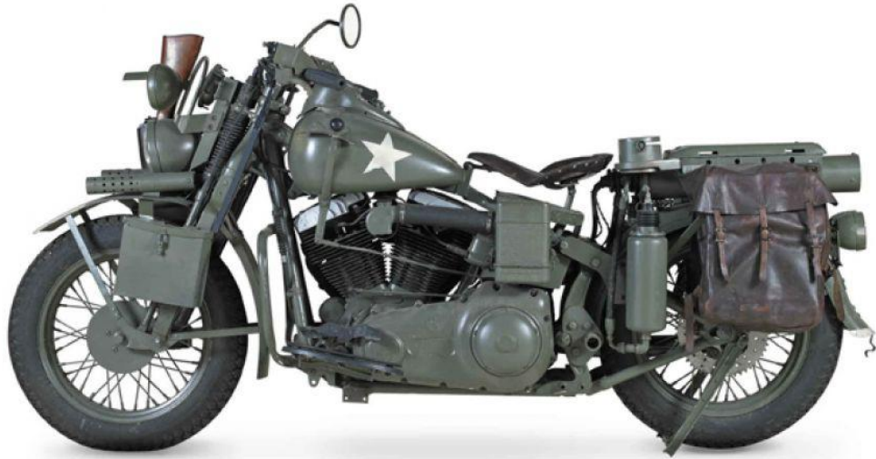
(Isaac's special motorbike)