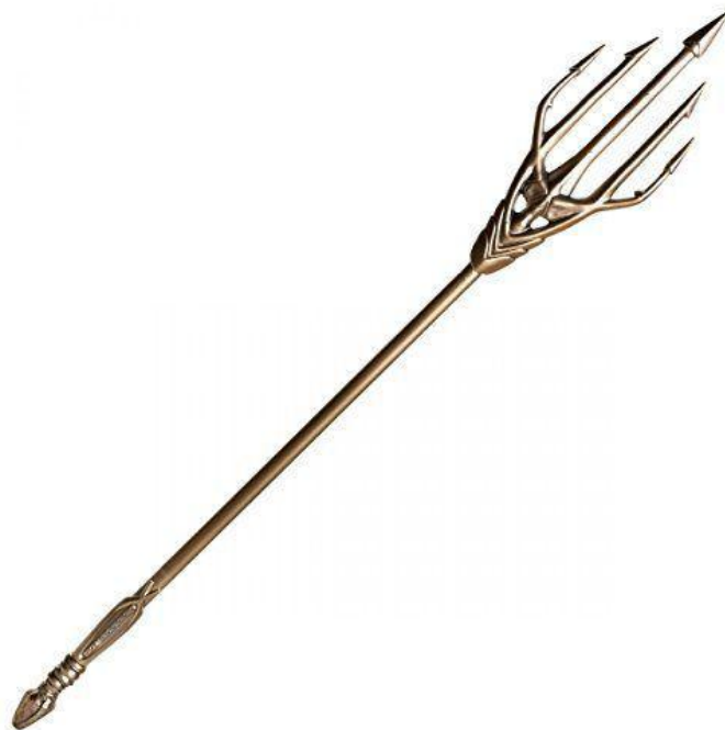
(Horus's golden spear in the Black sea's lost island)